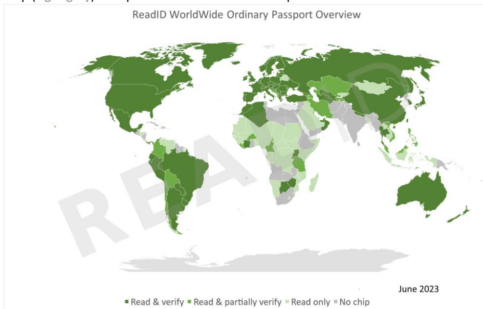
Figure 2. ReadID coverage on ordinary passports worldwide (June 2023)